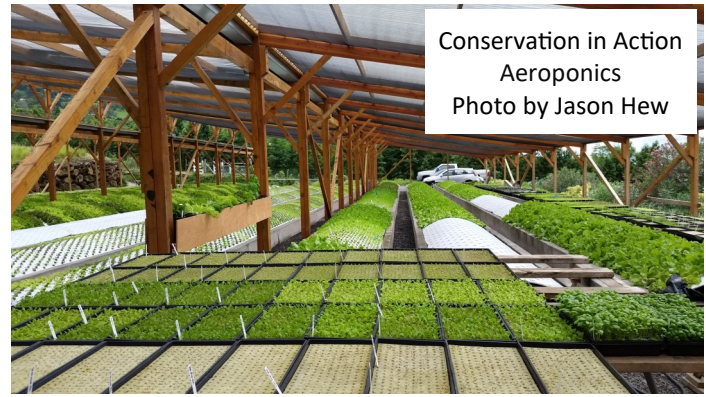
Conservation in Action Aeroponics

The winning photos will advance to the National Association of Conservation Districts photo contest.